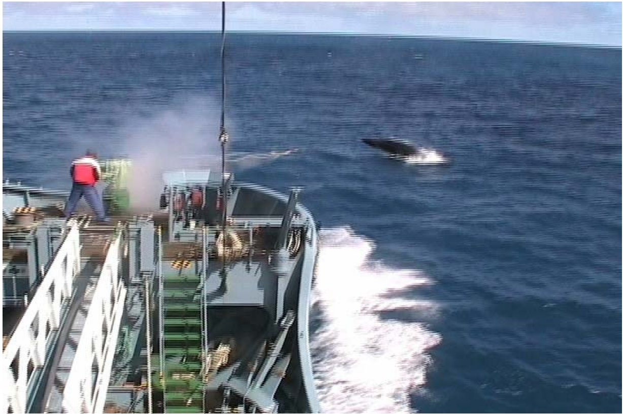
( 1 ) Sampling vessel Yushin-Maru No. 2 harpooning a minke whale. Note Greenpeace inflatable to the right of the bow, purportedly hiding from the harpooner's angle of view.