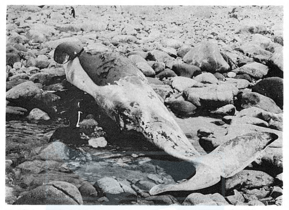
Fig. 1. Female Orcinus orca, stranded at Cormorant Island (64°47'S, 64°59'W) on a rocky shore (16 January, 1973).