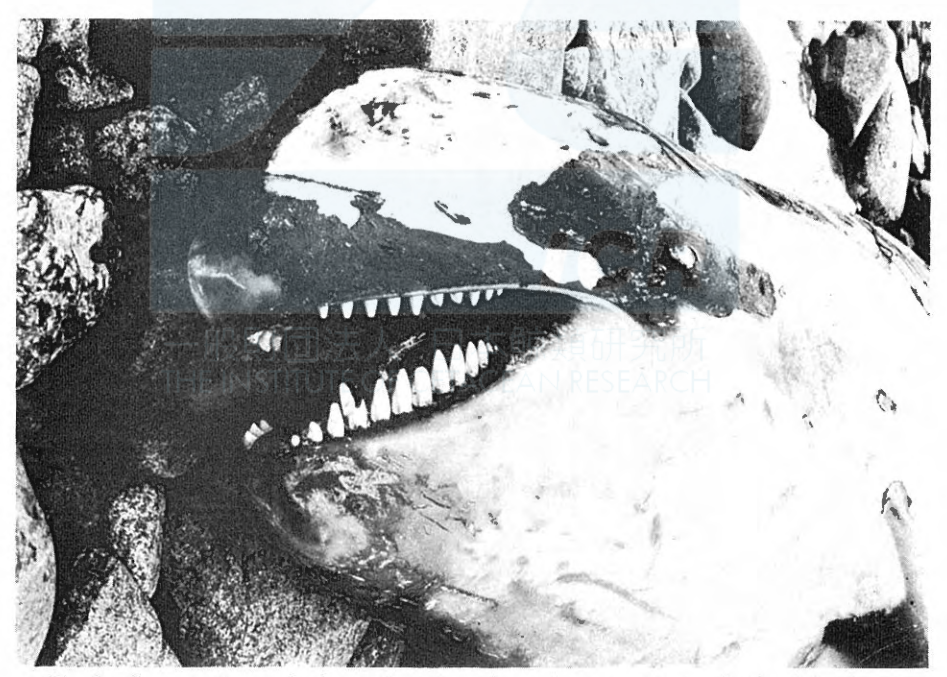
Fig. 2. Some teeth were broken, others showed certain wear related to feeding behaviour.

Sci. Rep. Whales Res. Inst., No. 26, 1974