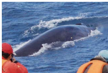
Photo 2. fin whale, a biopsy dart just hit it.