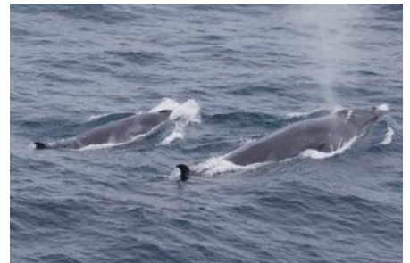
Photo 3. Mother and calf pair of sei whale.