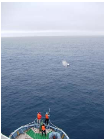
Photo 1. Biopsy sampling